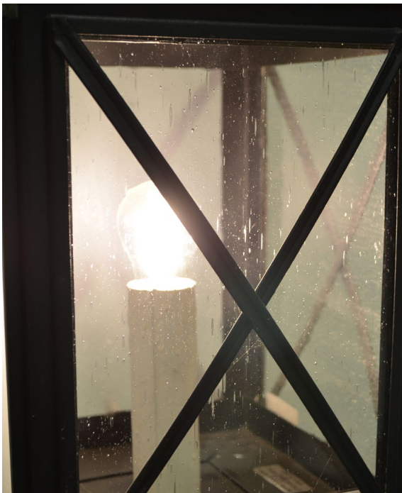
GL-C1115 Seedy glass