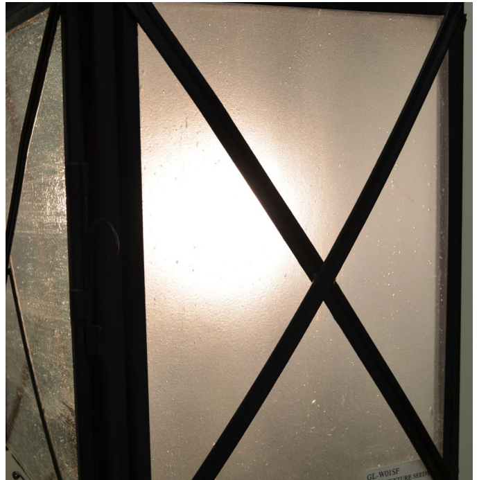
GL-W01SF Frosted seedy glass, +4%