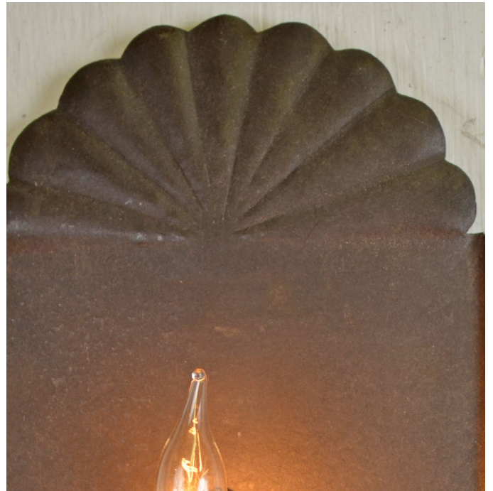
FIN-OT18D Dark old tin. Interior only.