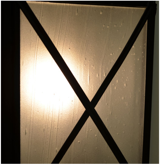
GL-C1033F Frosted ice textured glass, +4%