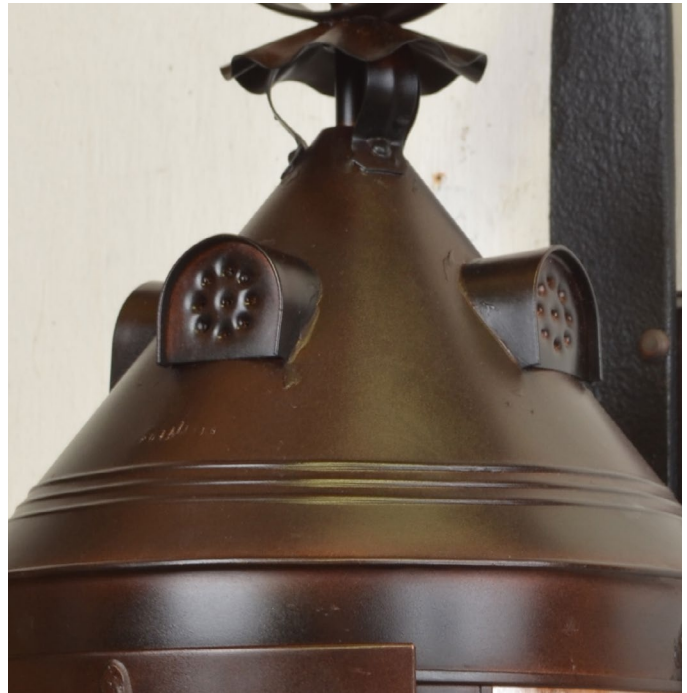
FIN-BRZOR19 Lighter oil rubber bronze