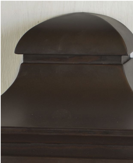
FIN-BRZOR Oil rubbed bronze