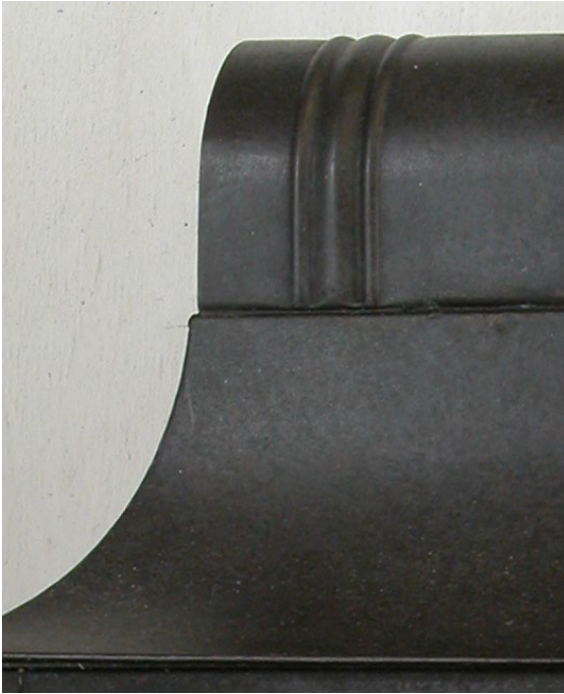
FIN-DLCC Dark lead coat copper. Requires 7% upcharge