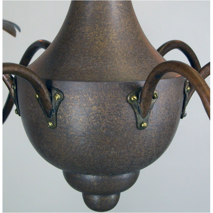
FIN-13016 Faux dark antique bronze