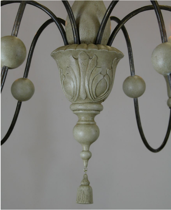
FIN-W0703 Antique white – note the swirl pattern on the top of the chandelier spindle.