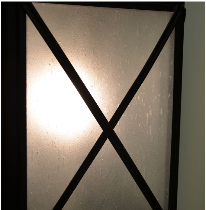
GL-C1115F Frosted seedy glass, +4%