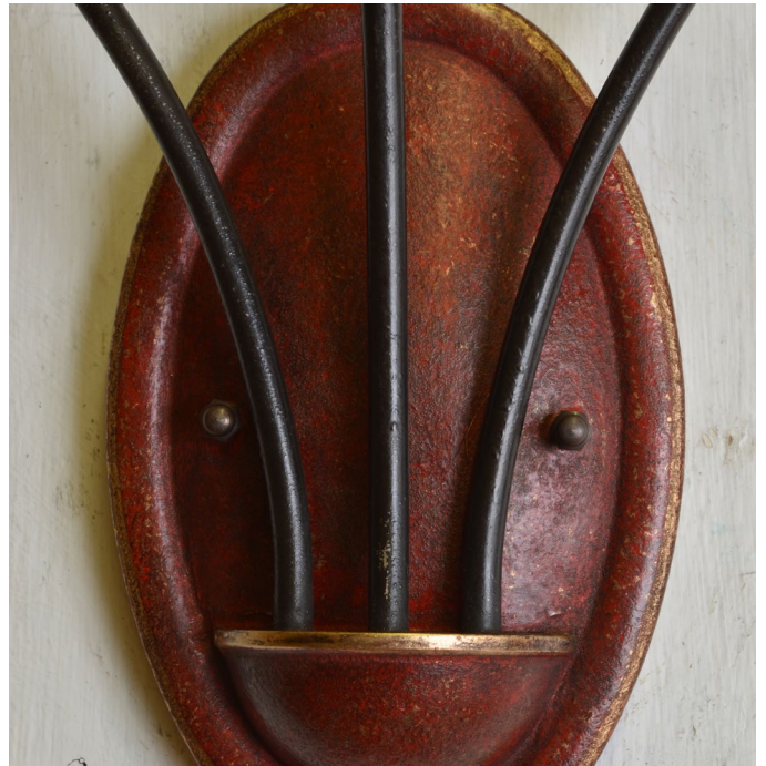
FIN-169RB2 Antique red with gold tones. We added some texture to this. These were for some sconces we did for Lawrenceville School in NJ.