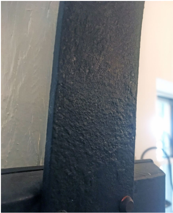
FIN-FXIREX Faux iron for exterior – The use of enamels allows for a heavier texture.