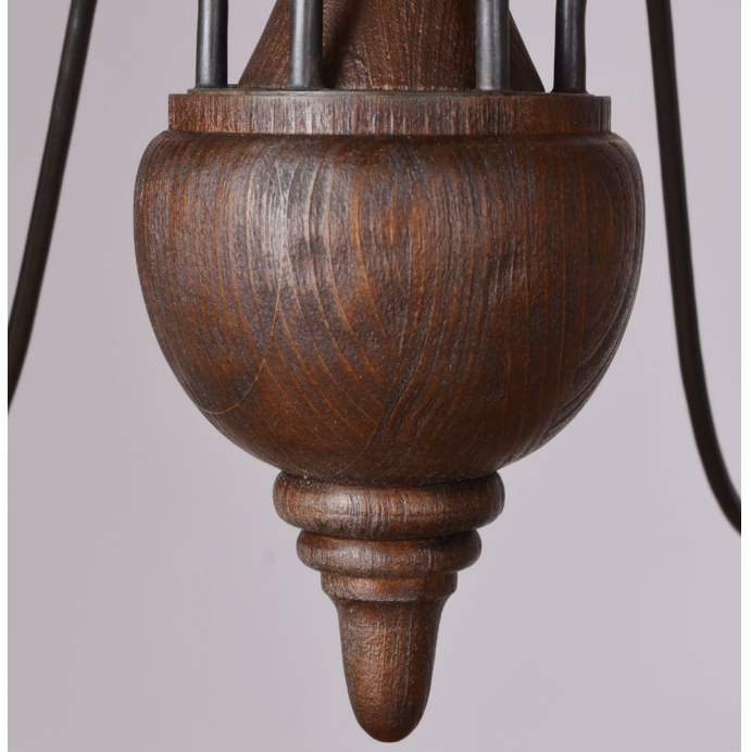
FIN-DSWD A distressed wood