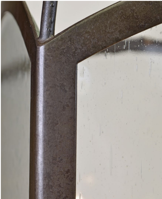
FIN-WI16 Wrought iron. Interior only. An oxidized finish on steel that is a good alternative to the standard straight black that passes for a wrought iron finish.