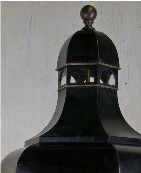
FIN-ANTBCU Blackened copper