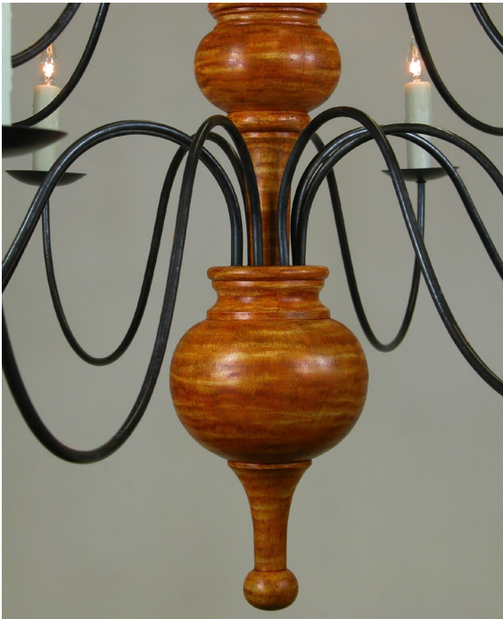
FIN-FXTMAPLE10 Faux tiger maple – We can do various faux woods, and marbles.