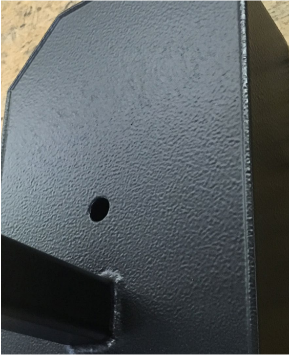
FIN-PCHB Black powder coat – A satin black textured powder coat. For exterior applications, especially in a salt air environment.