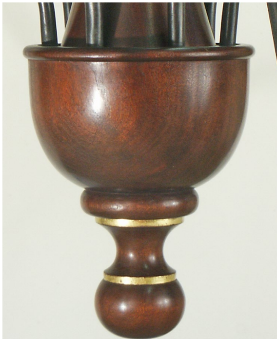
FIN-CHR Natural cherry wood, +30%. Note the 23K gold bands on the flats.

We do wood sconces, based on our chandelier spindles. They are basically halved chandelier spindles.