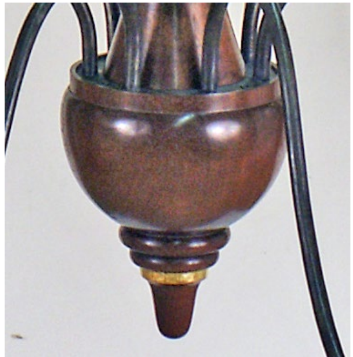
FIN-WAL Natural walnut wood, +30%. Again, note the 23K gold bands on the flat.