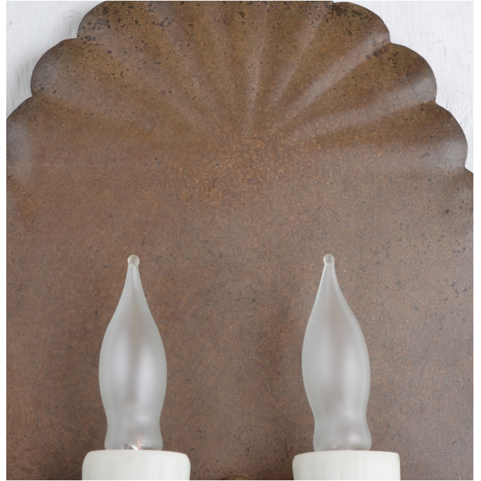
FIN-OTBRZ18 Old tin with a bronze tone.