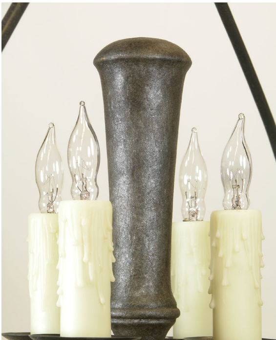
FIN-FXOP11 Faux old pewter – A lightly textured old pewter.