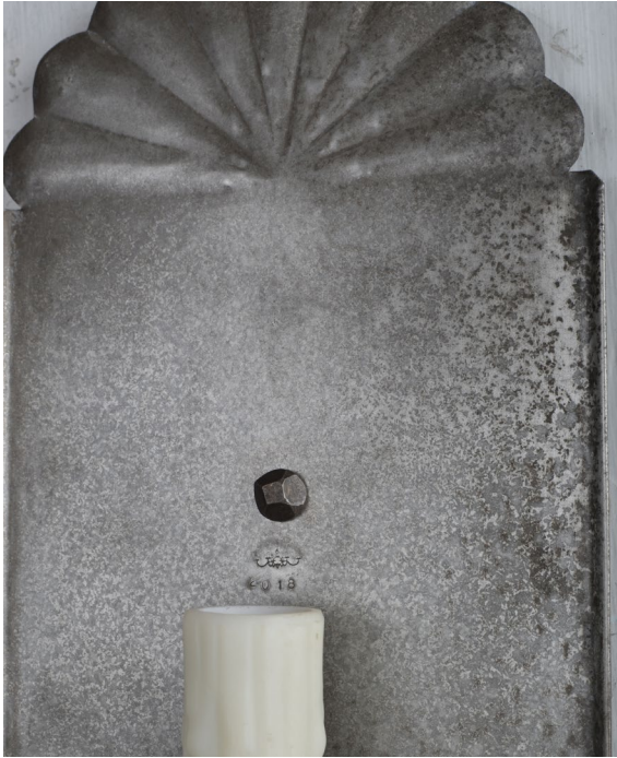
FIN-OT18L Light old tin. Interior only.