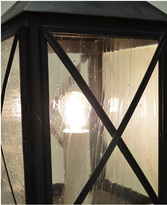
GL-C1033 Ice textured glass

Glass Selection: We offer various clear art glasses, as well as handmade restoration glass.