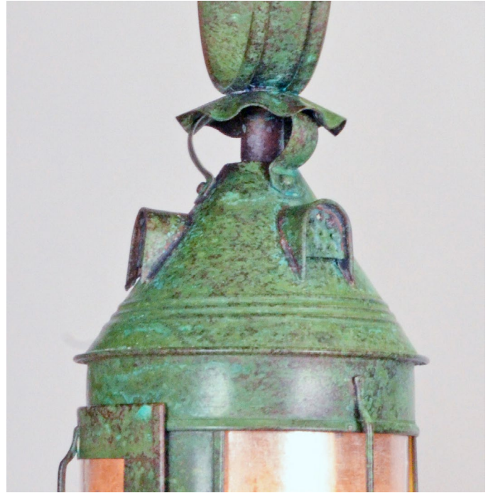
FIN-CUVERD Copper verdigris, +10%