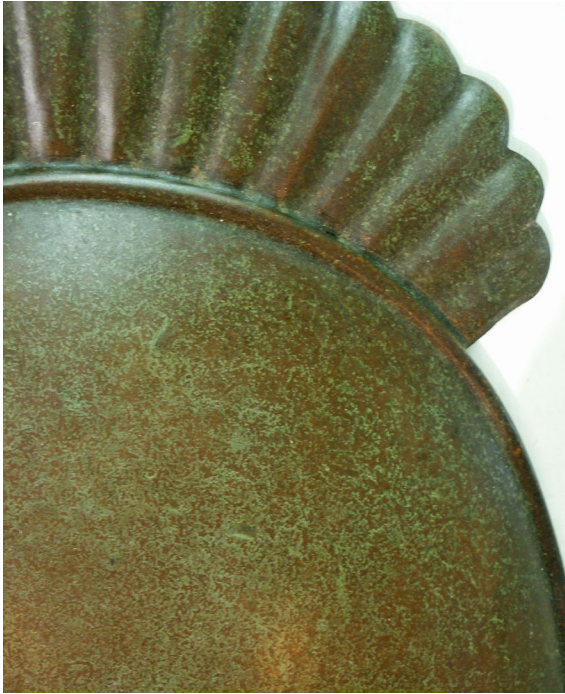
FIN-CUDVERD Dark copper verdigris, +15%