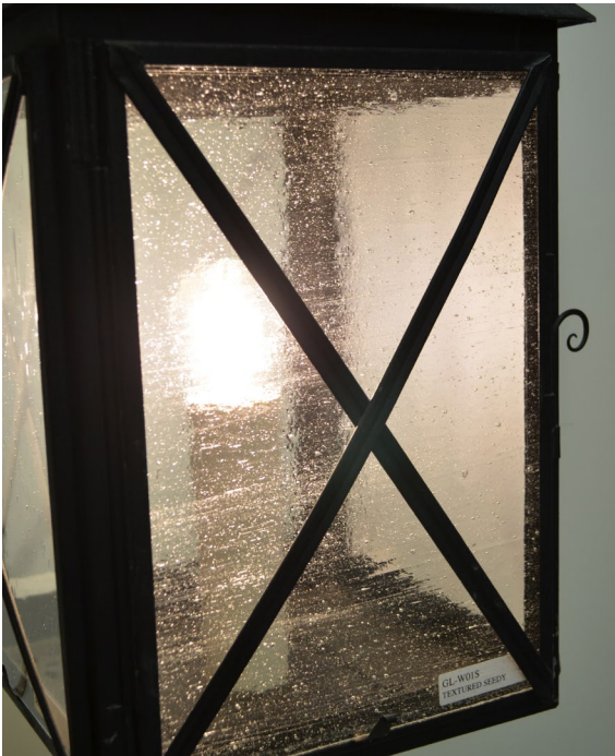
GL-W01S Textured seedy glass