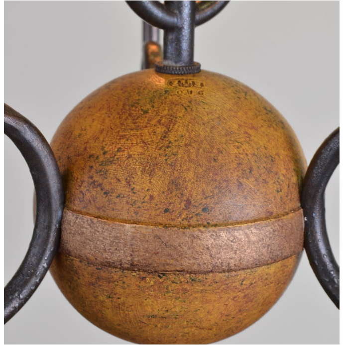
FIN-D15YL Antique yellow with red and blue undertones.