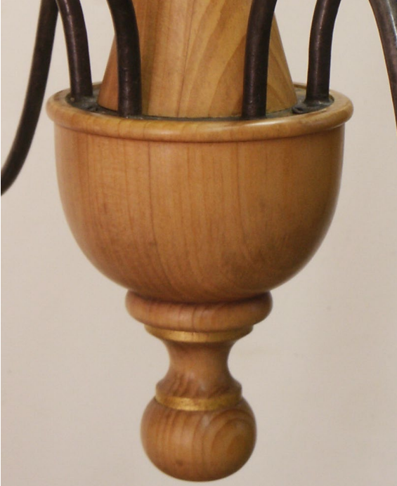
FIN-PINELAM Laminated natural pine, +10%