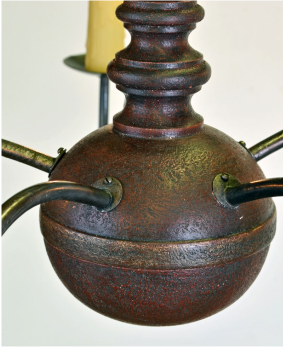
FIN-110301RD Heavy antique red. We used a heavier texture and added a heavily antiqued gold band in the center.