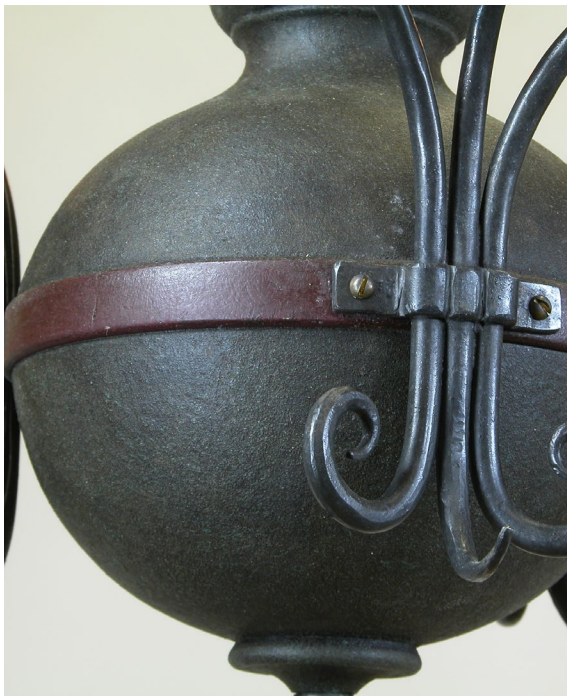
FIN-FXIRIN Faux iron for interior - A fine grained texture, reminiscent of a fine sand casting.