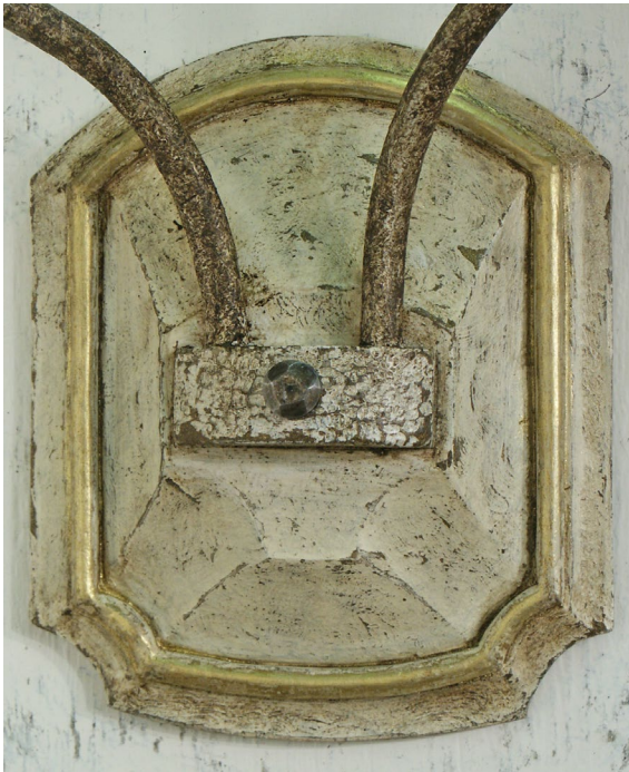
FIN-E0605 Antique eggshell white with gold banding.