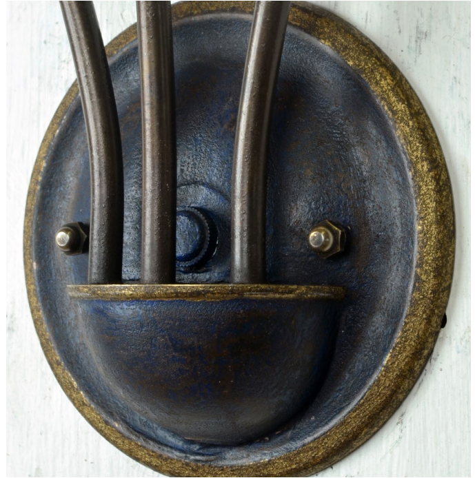
FIN-13014M1 Antique blue with antique gold trim. We did this on sconces for Millbrook School, in NY.