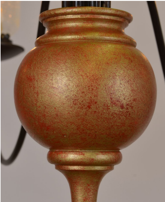
FIN-PRG2018B Gold rubbed back to a red – We used this for some chandeliers at Pennington School in NJ.