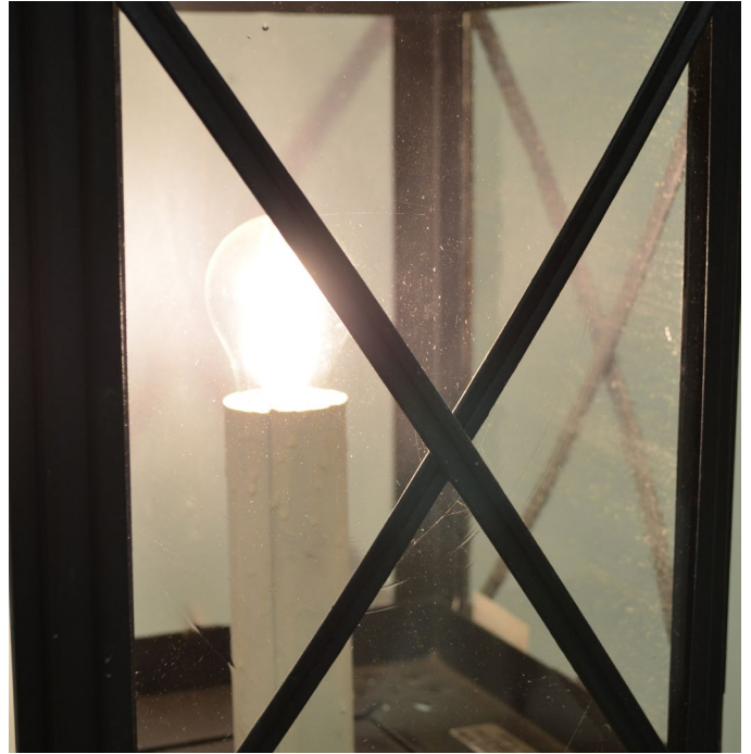
GL-RST Handmade restoration glass, +7%. This comes with varying degrees of imperfections from the manufacturer.