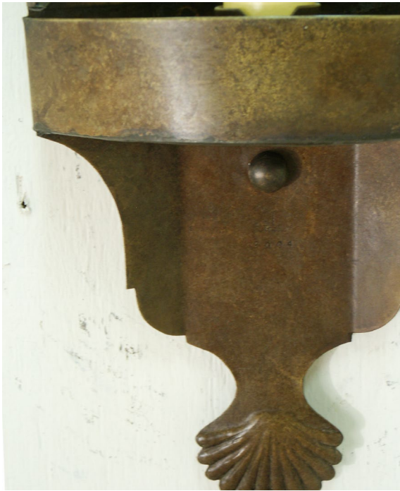
FIN-ANTMBR Antique medium brass, +15%. We can go lighter or darker.