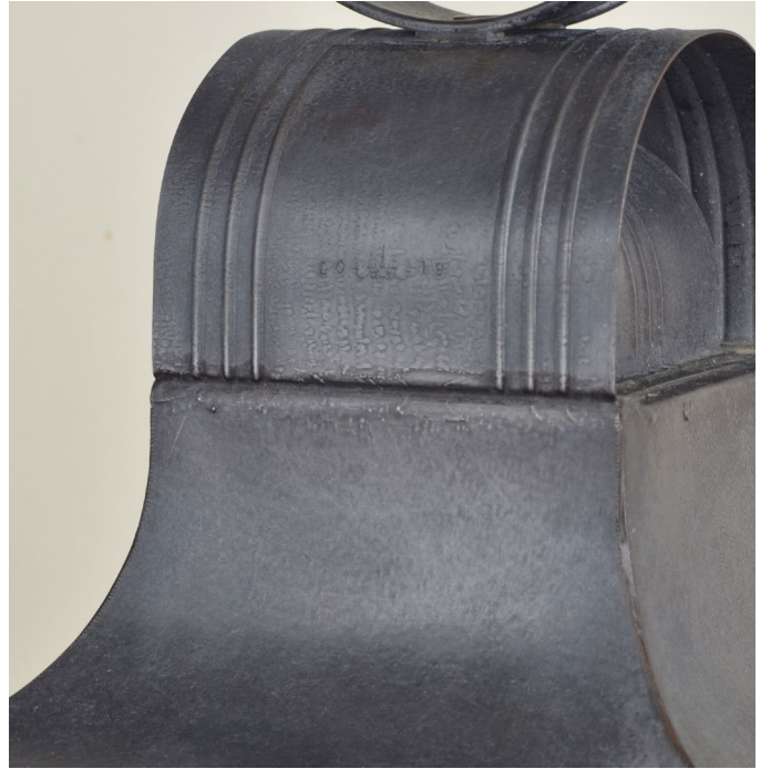
FIN-LLCC Light lead coat copper. Requires 7% upcharge.