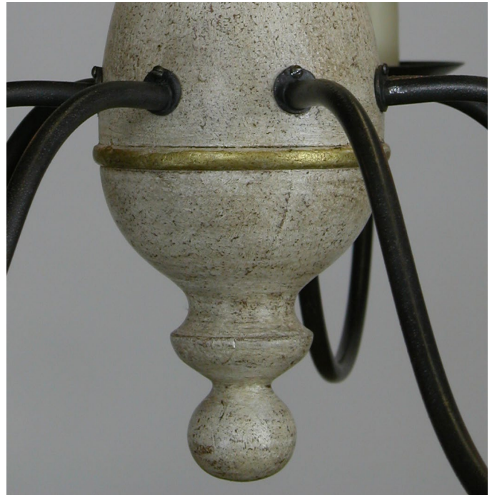
FIN-CH90011 Antique grisaille white, rubbed back.