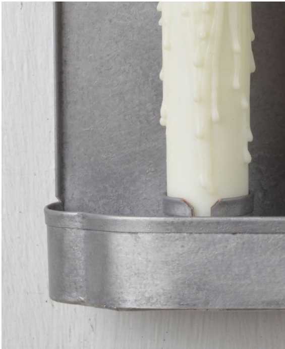
FIN-OPLCC Old pewter using lead coat copper