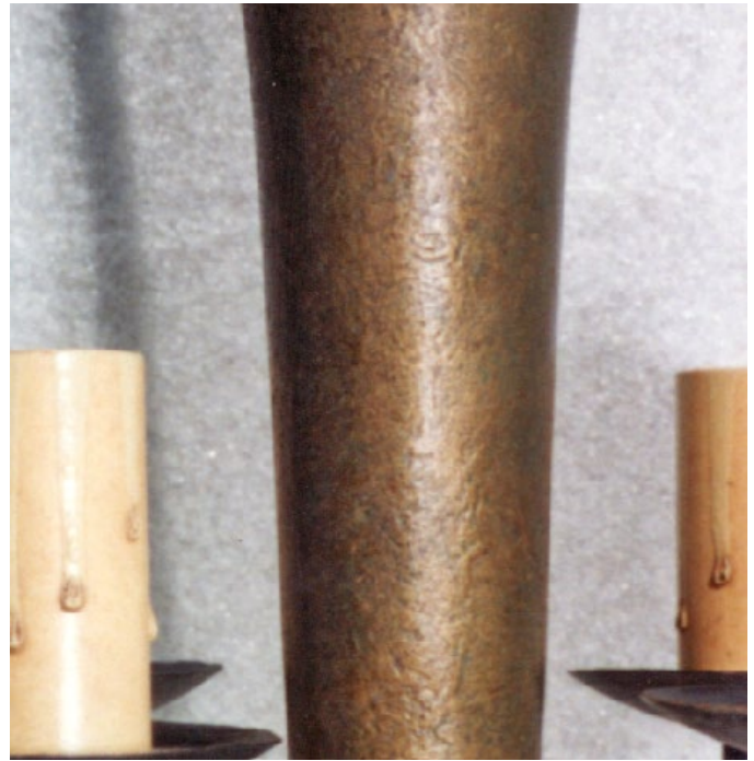
FIN-FXBRZ Faux bronze - A textured corroded bronze. Ask if you want a darker tone.