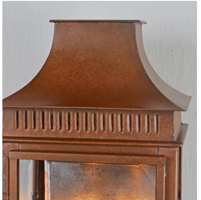
FIN-ANTCU Antique copper. This is a lighter version. We can go darker, and much darker.