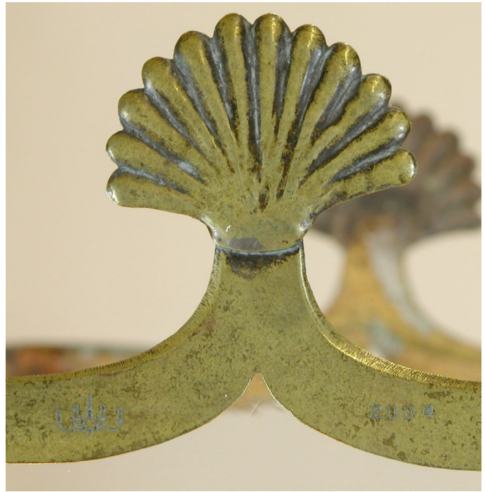
FIN-ANTPBR Antique polished brass, +25%. This is lightly etched brass and then polished back.