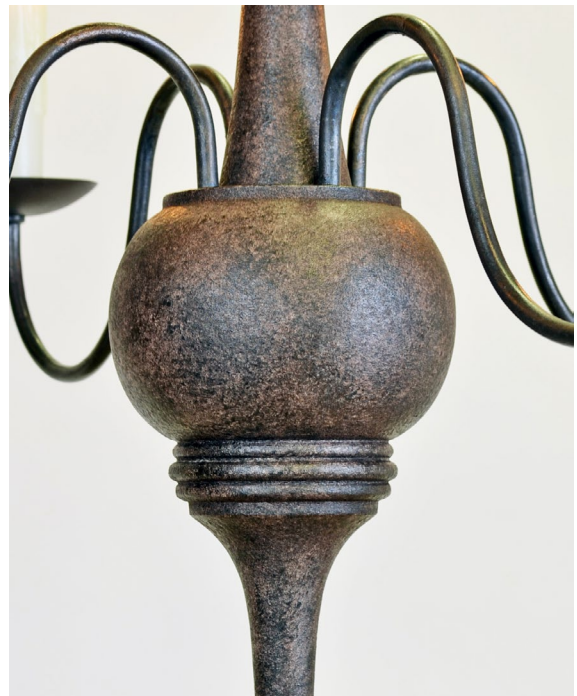
FIN-FXIRIN16 Faux iron for interior - A smoother sheen with light highlights.