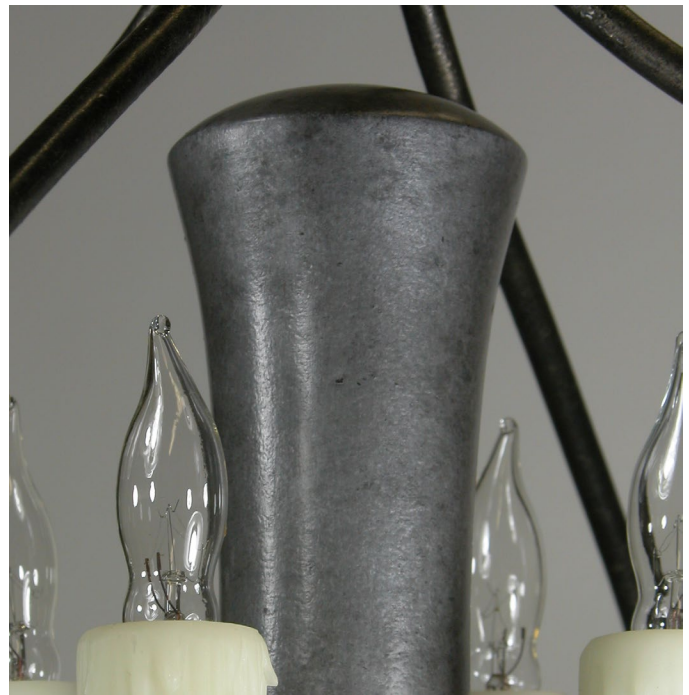
FIN-FXOP12 Faux old pewter – A non-textured faux pewter.